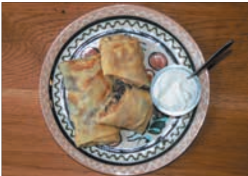
Pancakes with chicken

A folk band singing songs and dancing, as well as a special pancake menu comprising