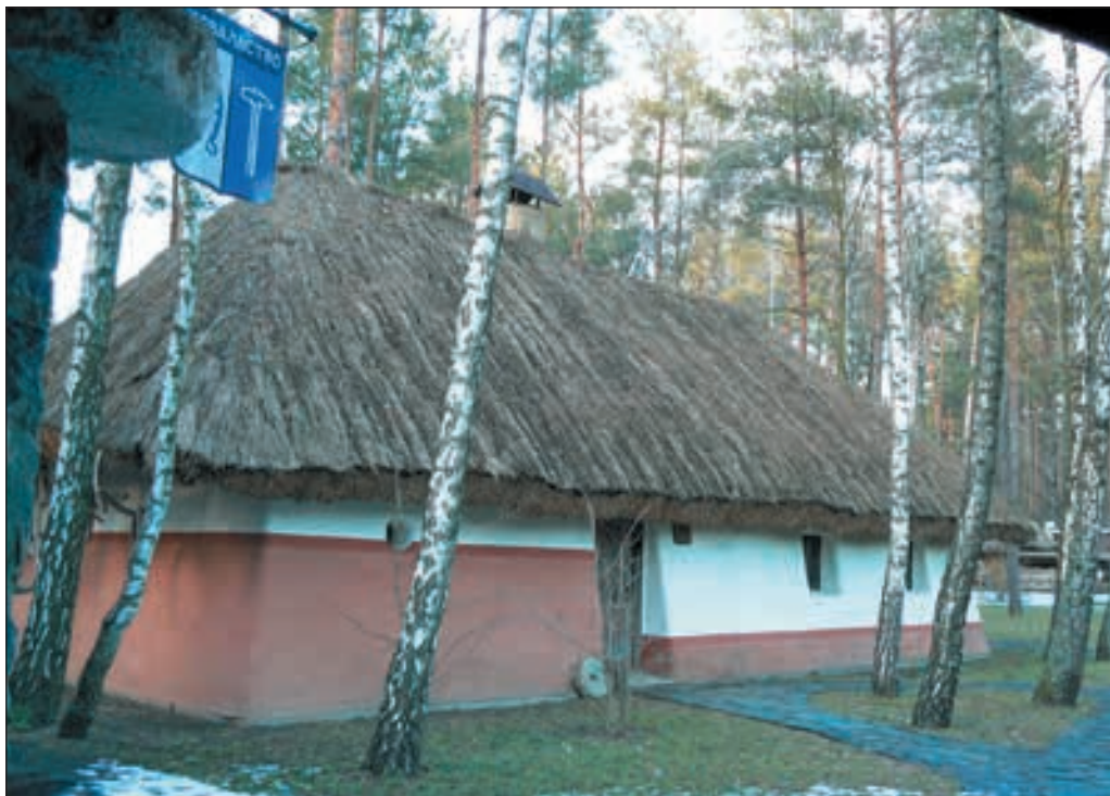
Khata with slanting walls and a thatched roof, depicted on the facility logo.

The ethnic restaurant and hotel houses are just a part of a large ethnographic facility called Ukrainian village that