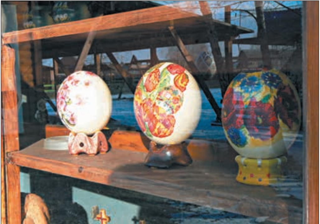
The painted eggs of ostriches are a great souvenir

The shell is not broken but used to make souvenirs — applying decoupage to paint and carve it. A souvenir egg price varies depending on the complexity of work.